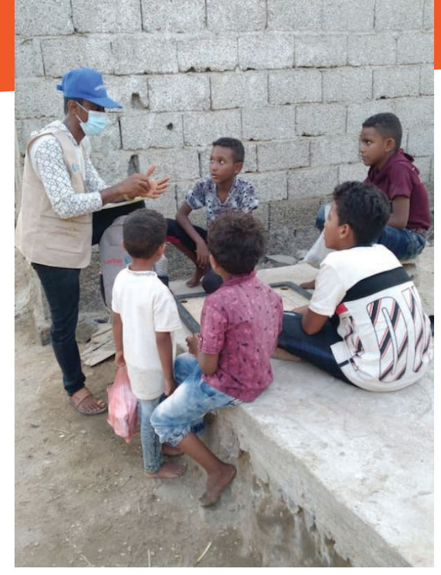
COVID-19 awareness campaign performed by community volunteers in September 2020. During the training PAH provided each volunteer with PPE (face mask, gloves and sanitizer).

School closures have impacted more than 1.5 billion children around the globe. The situation for the most at-risk children is aggravated by their lack of access to the safe space and services that schools provide, such as nutritious food and health support schemes, as well as access to school friends, teachers and social workers. Schools are places that protect children, provide stability and offer a sense of routine, and where children can feel safe.