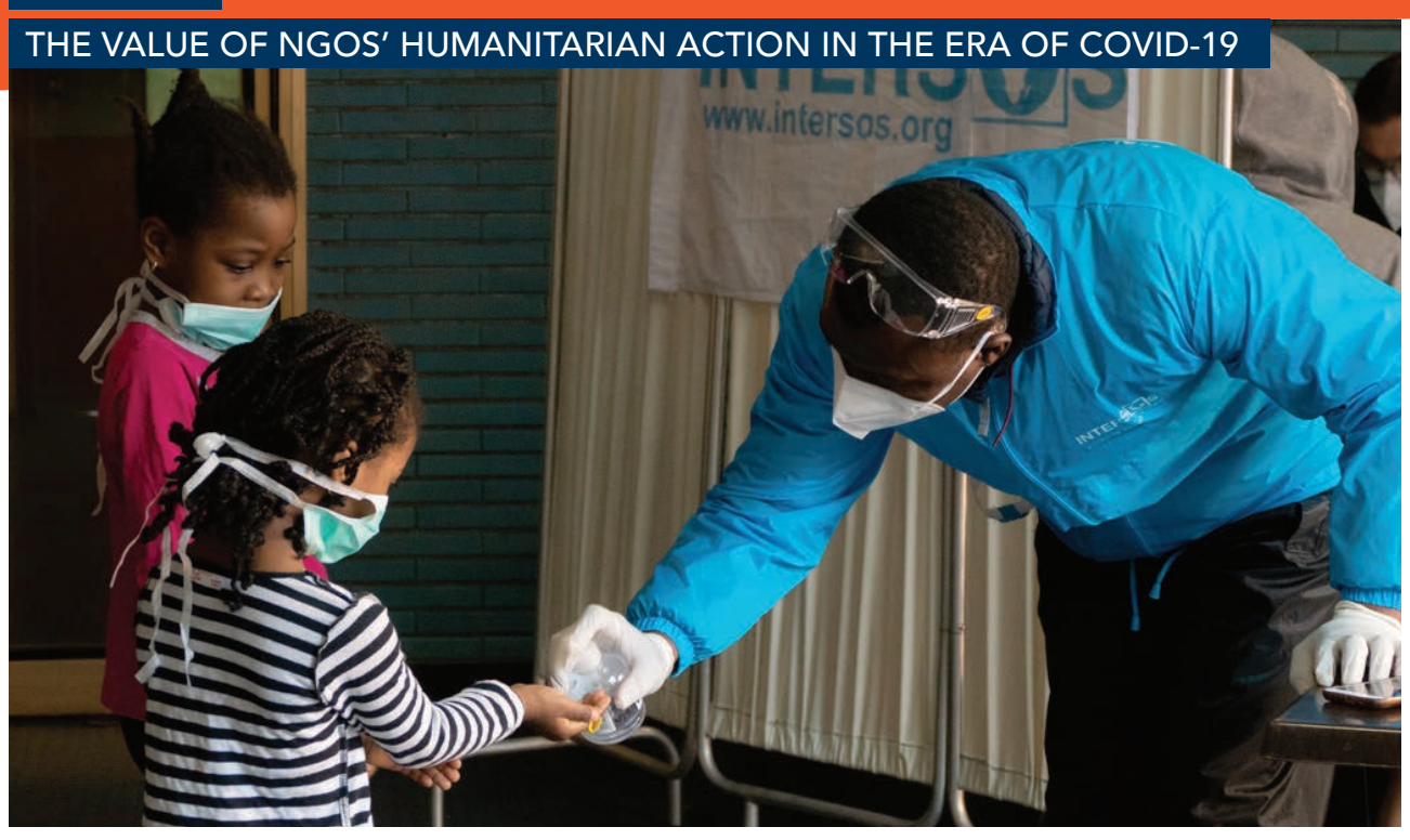
Intersos COVID-19 Response in Rome.

"We have the benefit of decades of experience in containing epidemics, such as outbreaks in Liberia, Sierra Leone, and DR Congo during the Ebola crisis, as well as cholera epidemics in Haiti, Zimbabwe and other countries."