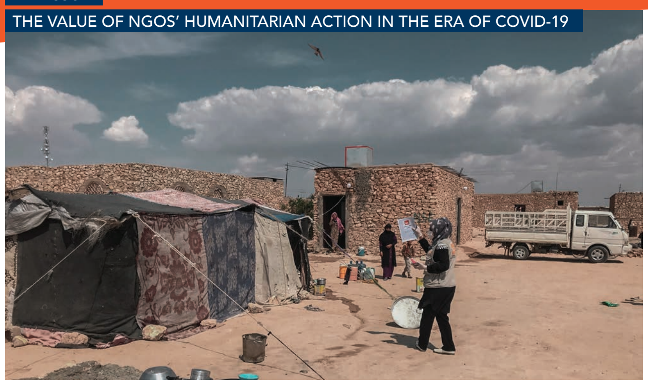
As the risk of COVID19 continues threatening the most vulnerable communities in Iraq, NRC - Norwegian Refugee Council team keeps supporting people in hard to reach areas. NRC

"Trócaire's central approach to programming is our partnership approach which we have developed and honed over the last forty-six years. This delivery model uniquely positions us to deliver a rapid and coherent response to the COVID-19 crisis through working with our established networks of local partners, including women-centred organisations. Together we can implement a response in a context where international access is extremely limited.