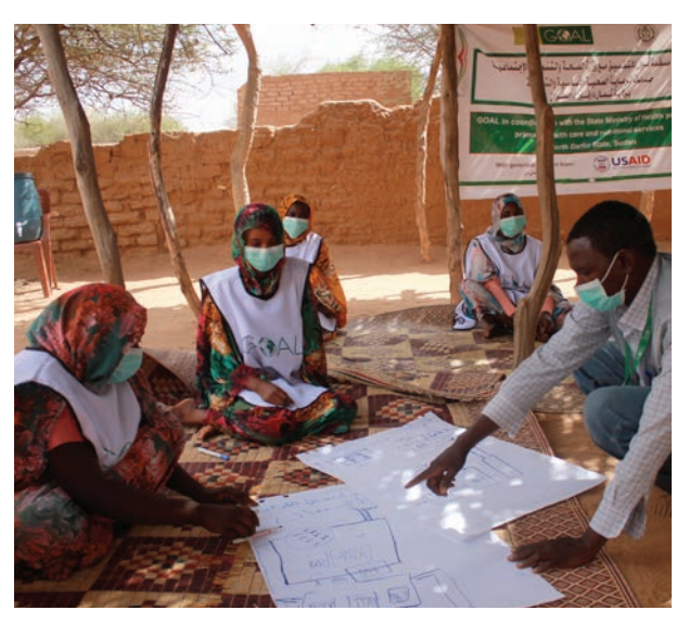
GOAL providing health care and nutritional services in the North Darfur

Today, more than ever, humanitarian NGOs emphasise on the need to continue supporting the networks of local health workers and community agents who are – and will remain – at the heart of prevention mechanisms and alert systems.