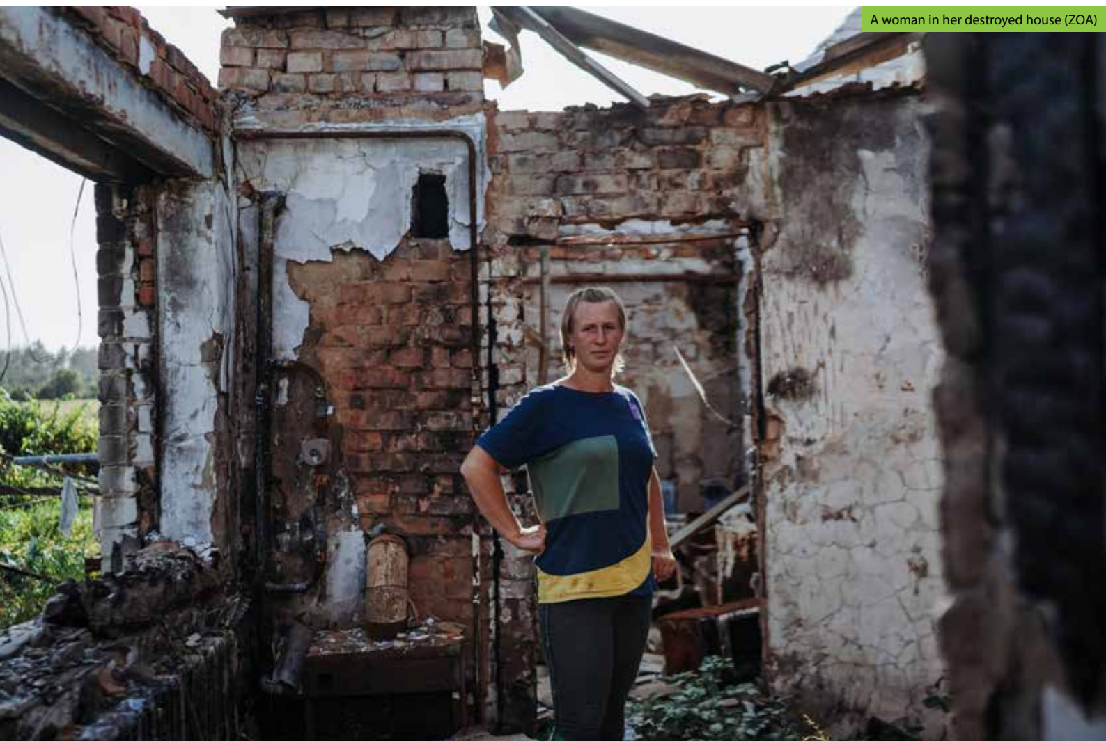
A woman in her destroyed house (ZOA)

ZOA to set up and use a digital CVA management platform for large-scale cash transfers. The platform allows for timely and secure cash distributions: people can collect their cash at any time, either online or at their preferred Money Gram location spread throughout Ukraine and neighbouring countries (including banks and Ukrposhta services). Moreover, digital and physical cash collection is possible, making it possible to offer a variety of options to targeted households. This reduces protection-related risks and costs for people in need, allowing them to – truly use the delivery mechanism they want and cover their needs.