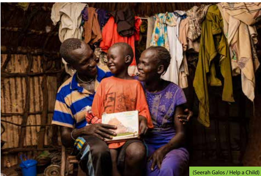
(Seerah Galos / Help a Child)

What is needed here is providing food, protection, trauma care and education in an environment with multiple needs. In short, we are providing stability in an unstable and unsafe environment. The places where we work have become safe havens for children, their families and friends. Vulnerable populations are identified by placing the child at the centre within their school context. Activities to strengthen the nutritional status of children, coupled with educational, protection and hygiene promotion activities in schools and the community, as well as food security and economic empowerment activities, have improved the quality of life of the beneficiary populations.