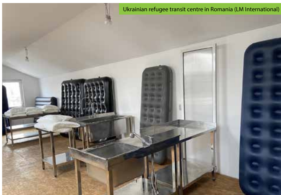
Ukrainian refugee transit centre in Romania

essential equipment, such as generators, winter clothing, and related supplies, to address the challenge caused by attacks on energy infrastructure. Across the border, our local partner in Romania has provided safe shelter for (transiting) refugees since the war started while providing basic food, NFIs and relevant psychosocial and legal support.