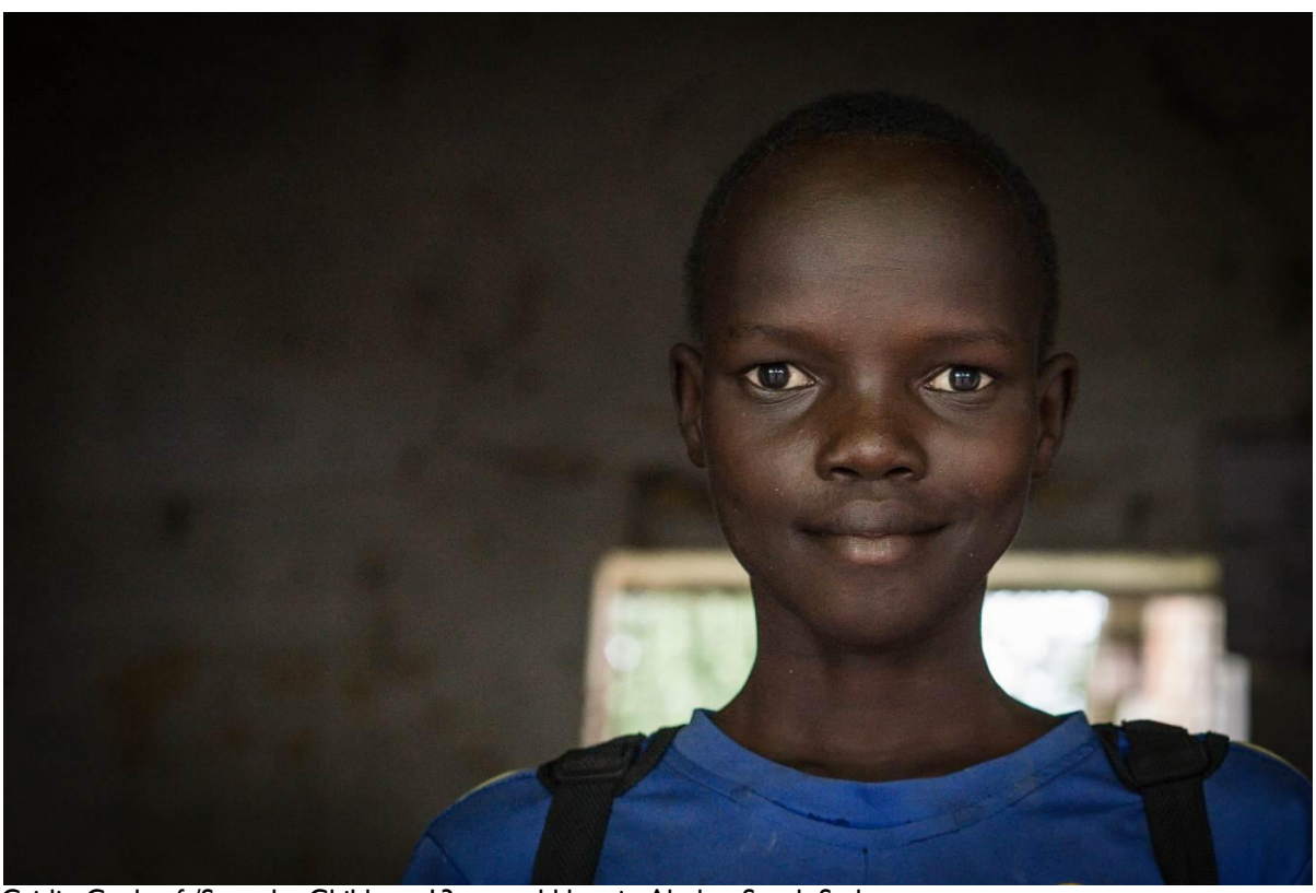
13 year old boy in Akobo, South Sudan

'Despite all the difficulties I faced as due to the war between the SPLA and the Sudan Government army, my education was never interrupted. As the current conflict continues, the Ministers and the Undersecretaries of tomorrow are at school today – but if the war interrupts their education, they won't live up to their potential.'