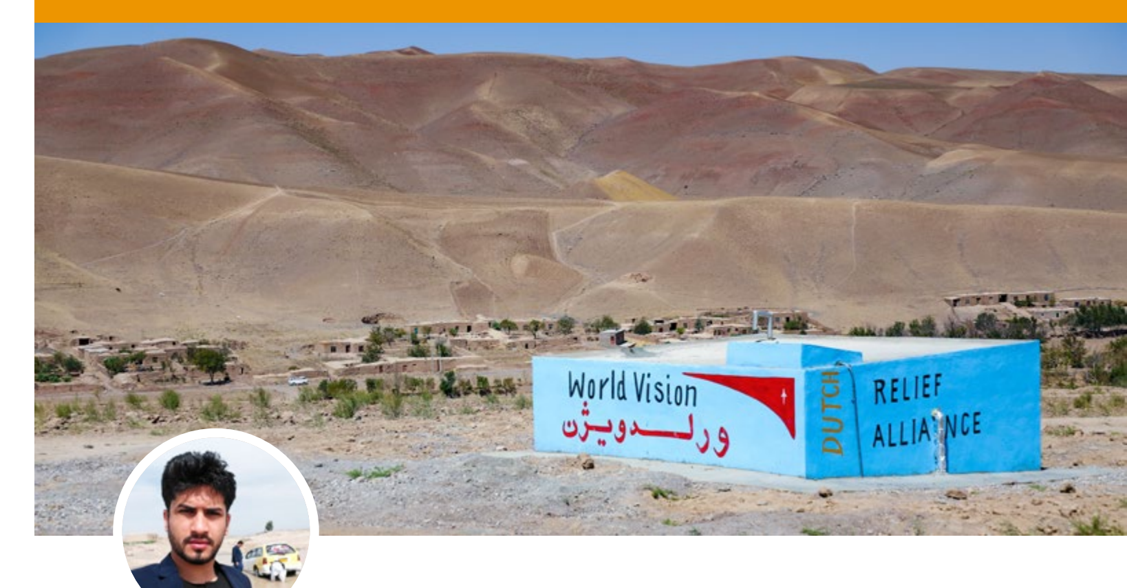
Sayed Qais Hussaini