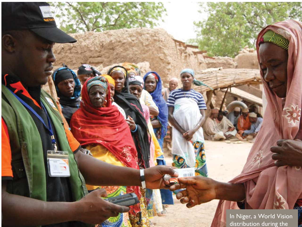
In Niger, a World Vision distribution during the food crisis.

World Vision is investing in improving accountability in the humanitarian sector by engaging in global initiatives such as the Commitments on Accountability to Affected Populations, endorsed by the Inter Agency Standing Committee Principals in 2011; the development of the Accountability to Affected Populations Operational Framework; the CDAC network working to promote better communication with affected communities; and the Core Humanitarian Standard, among others.