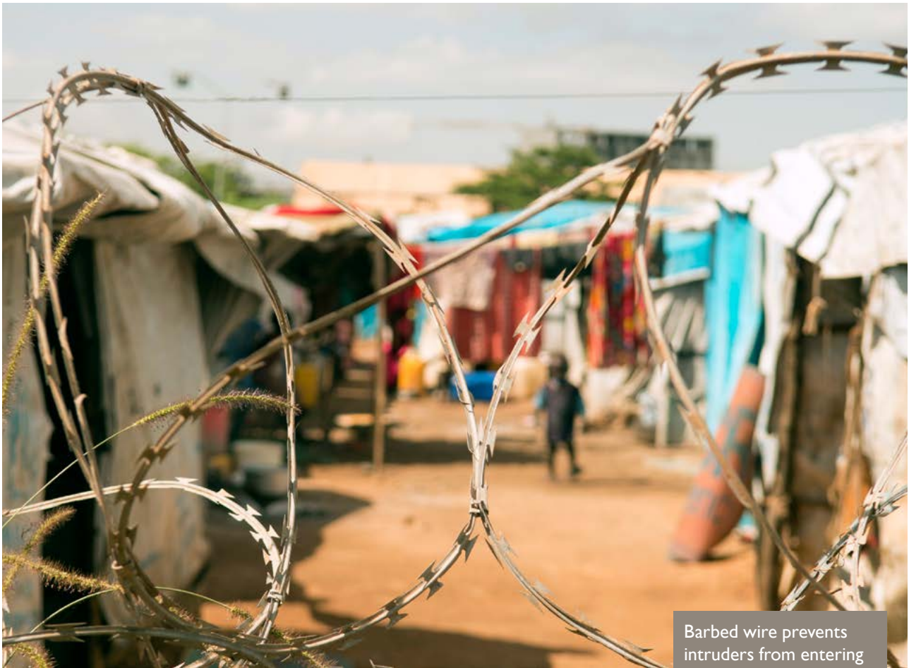
Barbed wire prevents intruders from entering an area built to protect people who have fled violence in Juba, South Sudan.

to review and compile a set of existing indicators that 1) can already apply to measuring impact of humanitarian action and 2) develop additional indicators that specifically focus on the impact of humanitarian action.