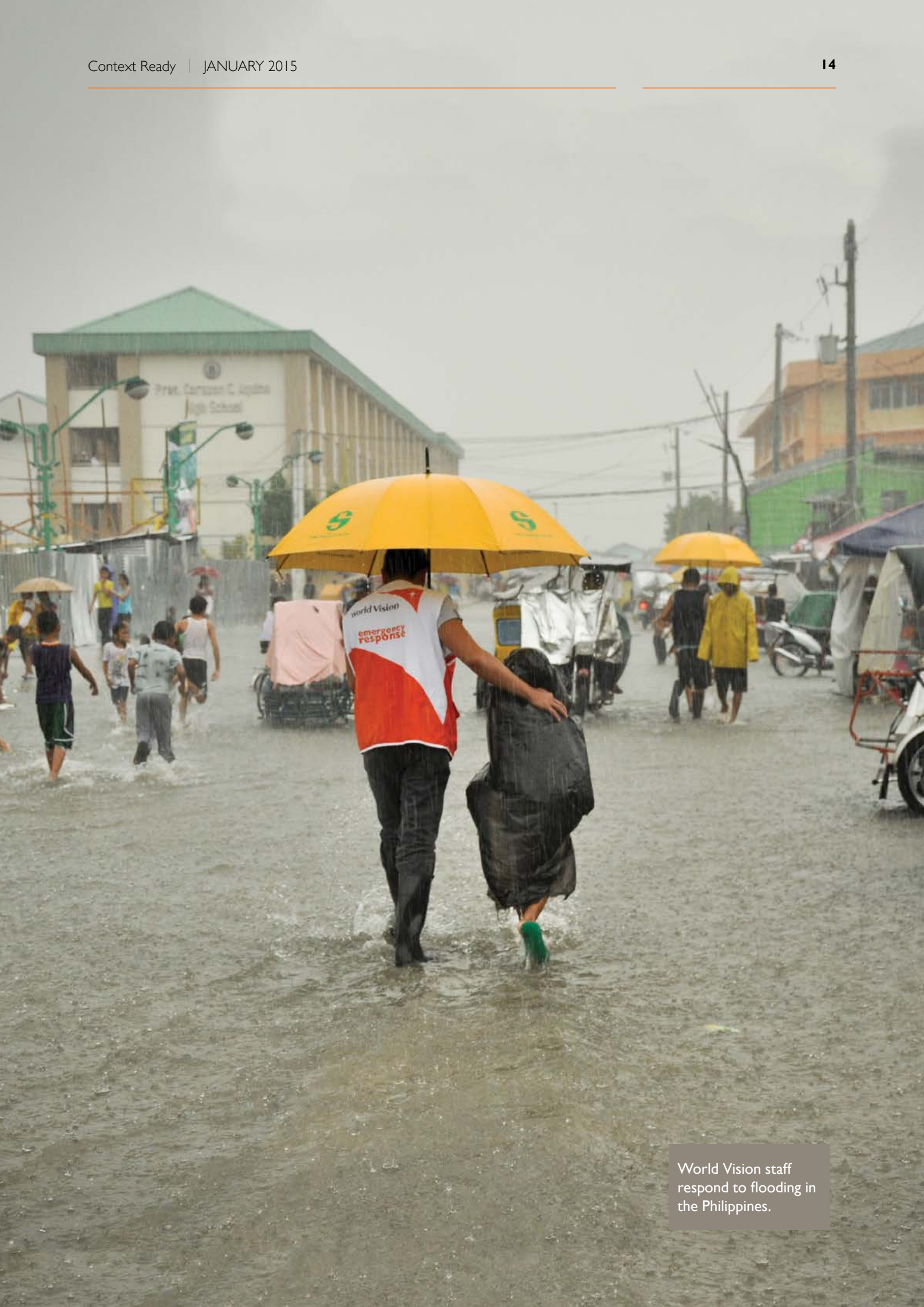
World Vision staff respond to flooding in the Philippines.