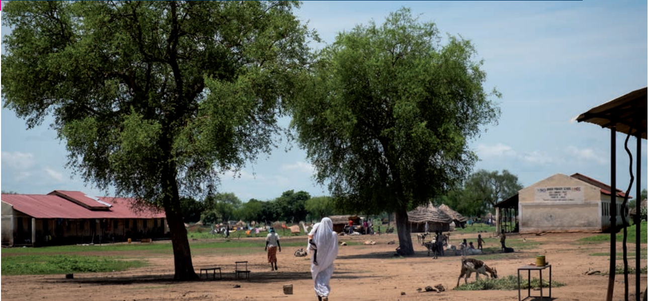
Women, in particular, commonly experience multiple trauma and sexual assaults during displacement. 50 percent of the world's nearly 110 million refugees, internally displaced, or stateless populations are women and girls.