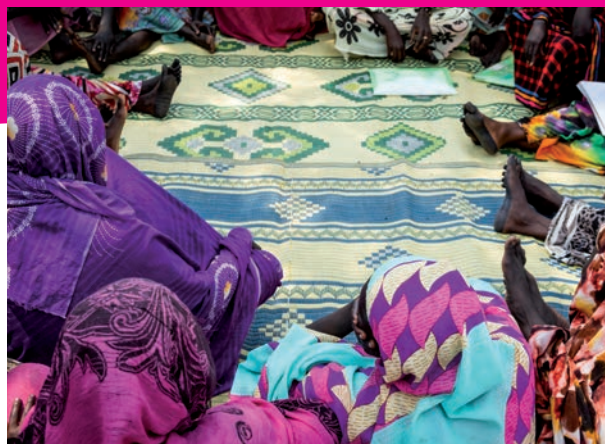
Relief International works closely with refugee and host communities to build safe shelters and social