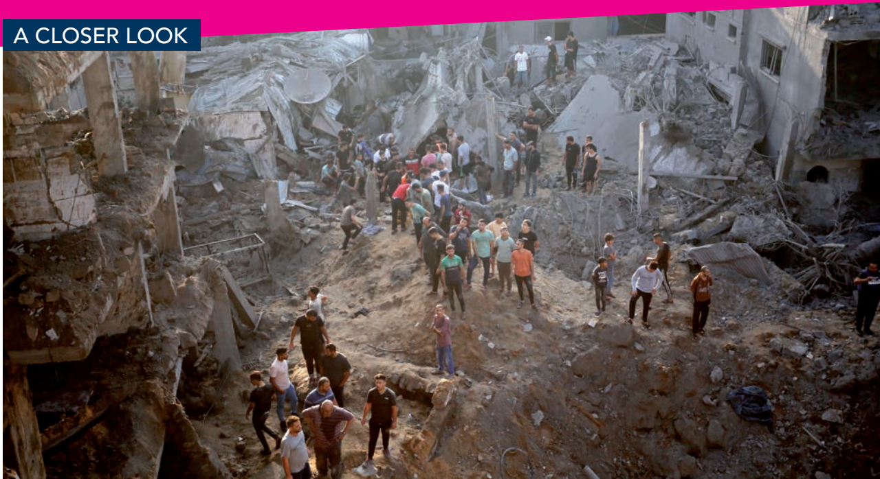
Palestinians conduct a search and rescue operation after the attack of the Israeli army at Maghazi refugee camp in Gaza City, Gaza on November 03, 2023.

The war on Gaza – indiscriminate bombardments, a complete siege of the Gaza Strip, and forced displacement of its population – exacerbated the humanitarian crisis in a context where the population has nowhere to escape.