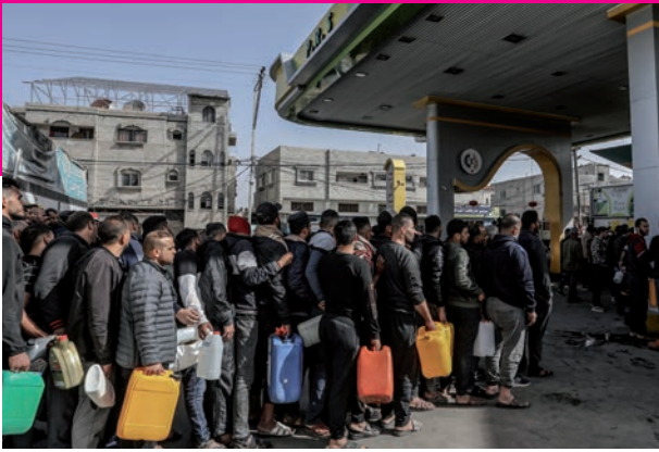
Rafah Palestinians, holding jerry cans, line up in front of a gas station to get gasoline and diesel on the third day of the Gaza truce.