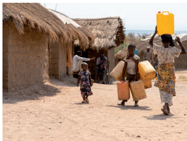
Boy carrying jerry cans (Kyamushenji, Tanganyika, DRC).

There is a need for holistic development to change the course of GBV from the current and constant rise to its decline and its much-anticipated demise. GBV is a reflection of steepening gender and social inequality. Persons with disabilities are three times more likely to experience physical, sexual and emotional violence than persons without disabilities; and women with disabilities are ten times more likely to experience sexual violence than women without disabilities 5 . Between 40%-68% of young women with disabilities will experience sexual violence before the age of 18. Building more equitable societies, supporting safer schools that in turn build-up stronger societies, strengthening democracy and the rule of law and judicial processes, and fostering an environment of healthy discussions around sexual and gender-based violence are all part of the journey to eliminating GBV.