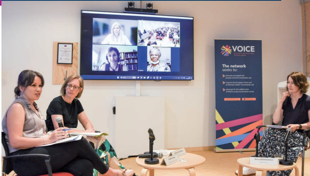
The panel of experts at the VOICE event "Fighting hunger: a women-led response"

“Even though women produce more than half of the food worldwide, and have been leading the response to the global food crisis, they are more likely to eat last and the least.”