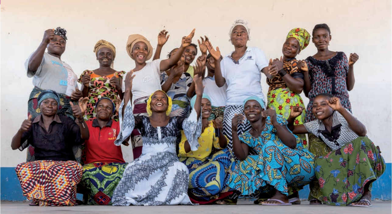
Group photo at Women's Empowerment Centre (Centre d'autonomisation des femmes) (Kimanga IDP settlement, Fizi, Baraka, DRC).

Gender-based violence (GBV) is an umbrella term for any harmful act that is perpetrated against a person's will, and that is based on socially ascribed differences between males and females. It includes public or private acts that inflict physical, sexual, or mental harm or suffering, threats of such acts, coercion, and other deprivations of liberty. 1 Some common manifestations of GBV include e.g. child marriage, female genital mutilation, trafficking, and intimate partner violence. 2