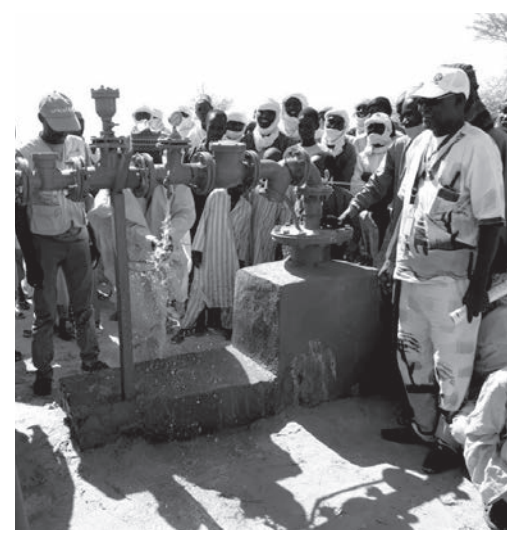
Diffa Region, ACTED

In Niger, the implementation of this New Way of Working will first focus on identifying key actors and relevant coordination mechanisms as well as priority areas. After a review of the humanitarian data and a further review of existing development studies and approaches, 3 to 5 common results are to be jointly identified in 2018 and integrated into the relevant national plans, in order to streamline the strategy and the expected outcomes. Then, a tripartite coordination structure involving humanitarian, development and government actors will be set up to ensure the follow-up of these results.