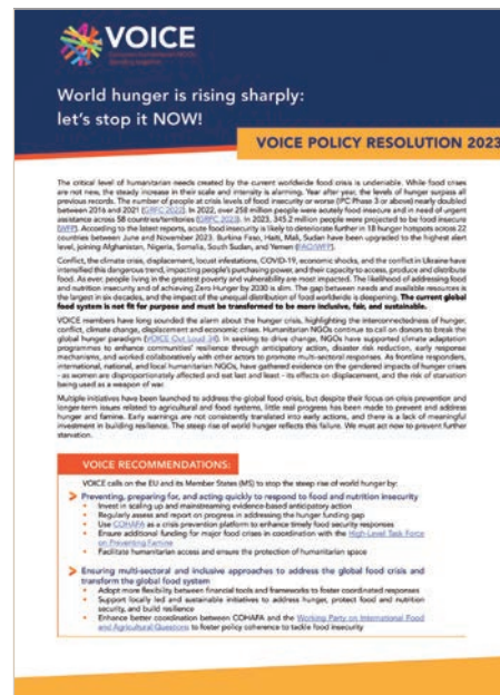
VOICE Policy Resolution 2023

The objective of the Policy Resolution was to stress the need to act quickly to prevent the alarming increase in famine rates and to protect food and nutrition security. It emphasised the inadequacy of the current global food system. The Policy Resolution included a series of recommendations for the EU and its Member States to stop the steep rise of world hunger.