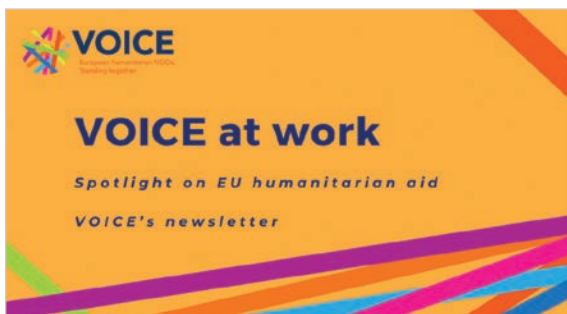
VOICE at Work, the external VOICE newsletter

The VOICE at Work newsletter was established as VOICE's external newsletter. In 2023, the VOICE Secretariat published three issues of the newsletter, which had been introduced for the first time in 2022, to raise awareness of VOICE and its members' work in delivering principled humanitarian aid to communities in need worldwide.