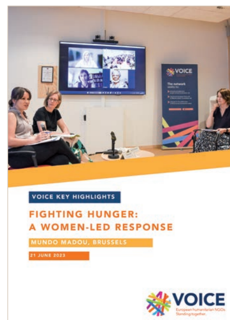
VOICE event 'Fighting hunger: a women-led response' – Key highlights

VOICE engaged further on the topic of hunger from a humanitarian perspective and organised one of its two yearly events around this concern. Questions included: How can humanitarian practitioners and donors help to create an enabling environment for local women so that they can play a leading role in the hunger crisis response? What are the current obstacles to doing so, and how can we overcome them? In June, the VOICE event "Fighting hunger: a women-led response" addressed these questions by looking at the role of women in the fight against hunger worldwide. The VOICE key highlights of the event were published later in the year.