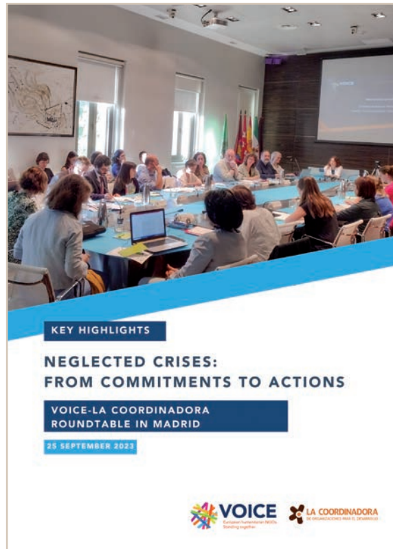
VOICE - La Coordinadora roundtable in Madrid “Neglected crises: from commitments to actions” – Key highlights

In preparation for the Belgian Presidency in January 2024, VOICE strengthened its close collaboration with some Belgian humanitarian non-governmental organisations (NGOs) to provide input on humanitarian priorities.