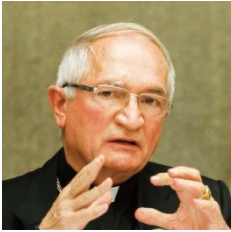
Archbishop Mons. Silvano Tomasi, Apostolic Nuncio, Permanent Observer of the Holy See to UNOG