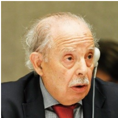
Ambassador Slimane Chikh, Permanent Observer of the Organization of Islamic Cooperation (OIC) to UNOG