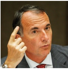
Franco Frattini, President of the Italian Society for International Organization & Former Italian Minister of Foreign Affairs