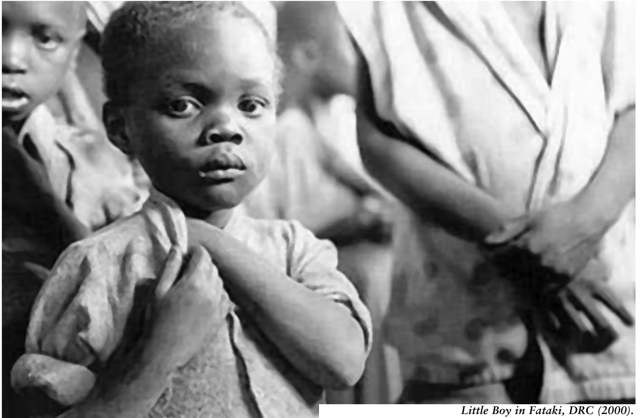
Little Boy in Fataki, DRC (2000).

big challenges ahead for humanitarian aid. But this is also a very exciting time, and an important one. The EU, and ECHO in particular, have made bold moves declaring the importance of independence of humanitarian aid, and confronting the “forgotten emergency” problem. However, the EU must now take strong steps to demonstrate — to other governments, to the taxpayers, and to the global community — that it is committed to the basis of humanitarian aid — with the objectives of saving lives, alleviating suffering, and restoring human dignity.