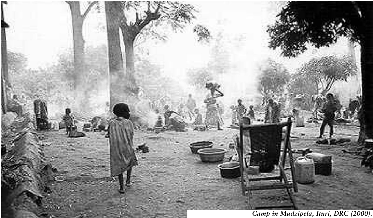
Camp in Mudzipela, Ituri, DRC (2000).

it a forgotten war as 2.5 million people had lost their lives, mostly due to disease and displacement; even with this death toll, the country was ignored by all the major donors until ECHO changed its approach that year.